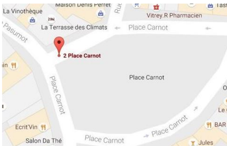
Click on the map to open Google Maps

To facilitate your trip, you can locate « la Terrasse des Climats » on Google Maps and Apple Plans .