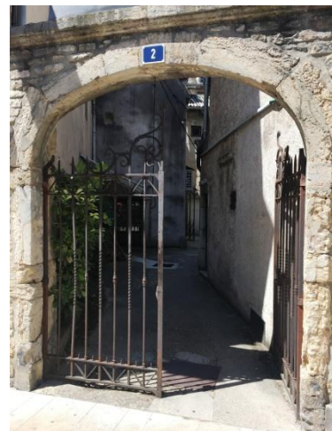
2 place Carnot